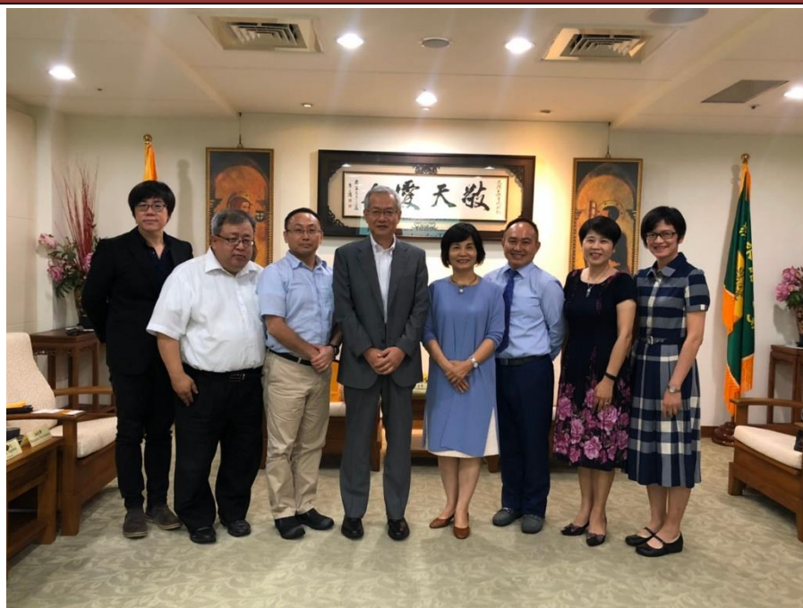
會後合影 Group picture

日本宇部工業高等專門學校 National Institute of Technology, Ube College