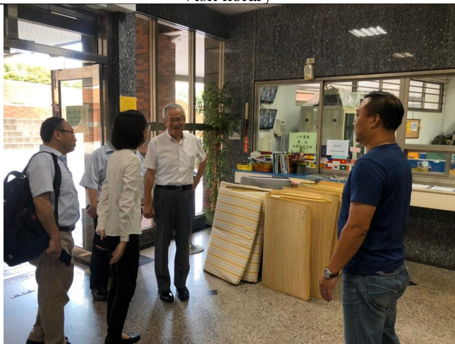
參觀宿舍 Visit accomodation