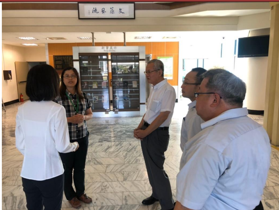
參觀圖書館 Visit library