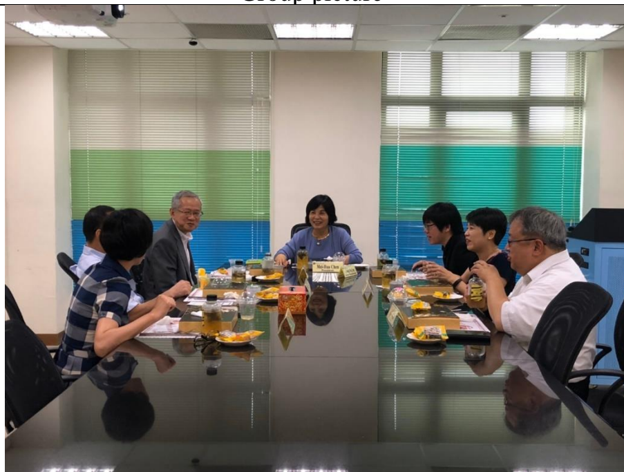
會後餐敘 Lunch meeting